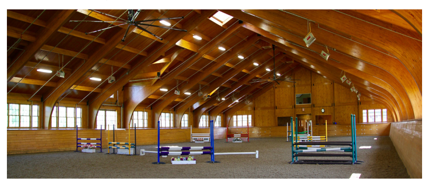
Silver Oak Stable wishes everyone a safe and successful show season. We are open for boarding.

604 Moriches Road • St. James • NY • 11780 • 631-584-3432 • www.silveroakstable.com